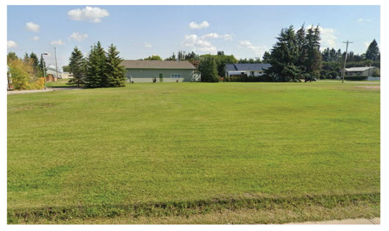
Development Land - Street View