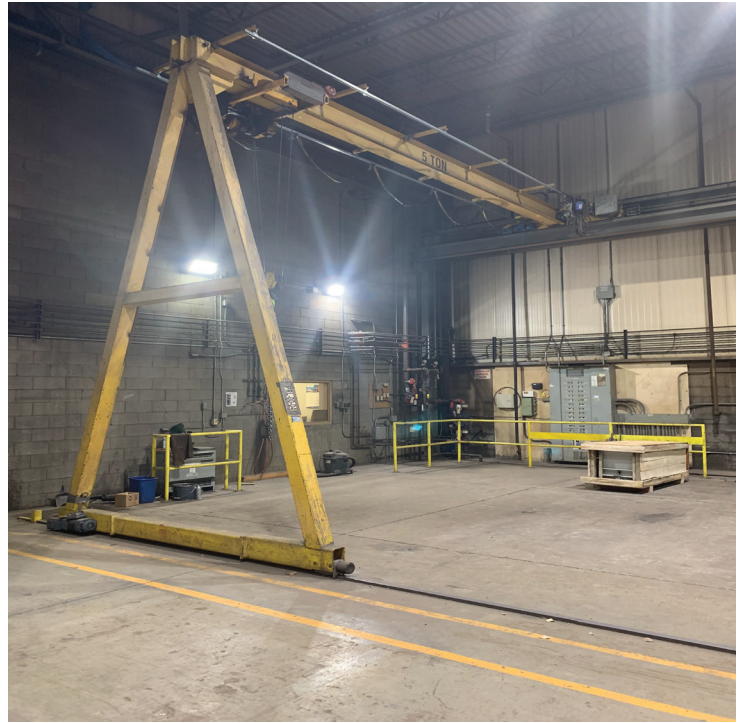
5 Ton crane