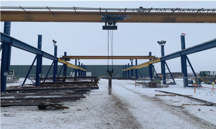
Outdoor crane way