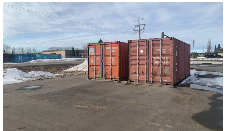
Sea can storage