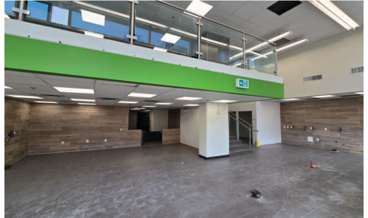
Mezzanine over looks main floor